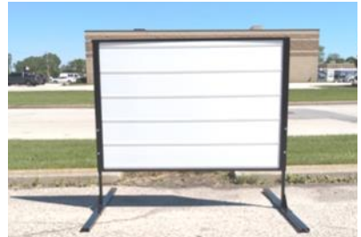
10 Inch Height

shown. The bolts may require light tapping to clear residual paint from the holes. The wing nuts are not designed to clamp down on the steel sign frame, only to keep it at a selected height. Holes (7/16 inch) are included at the ends of the leg extensions for staking to the ground. Additional tethering may be required for very windy areas.