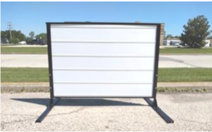
4 Inch Height

Step 2—Install Leg Assemblies into Sign Frame. The sign design offers two height selections, 4 or 10 inches from ground. Slide the two leg assemblies into the sign frame, aligning the holes in the leg with holes in the sign frame. Secure using included bolts and wing nuts as