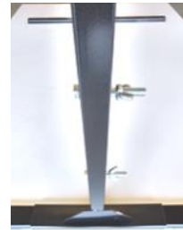
Bolts and Wing Nuts

shown. The bolts may require light tapping to clear residual paint from the holes. The wing nuts are not designed to clamp down on the steel sign frame, only to keep it at a selected height. Holes (7/16 inch) are included at the ends of the leg extensions for staking to the ground. Additional tethering may be required for very windy areas.